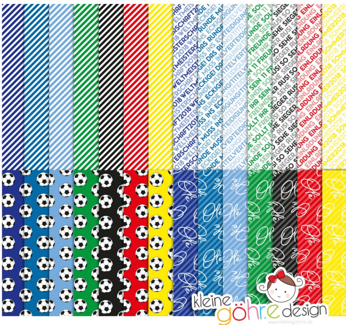
digitale Papiere "WM18 Basic1"