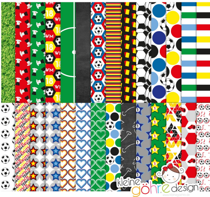
digitale Papiere "WM18 Muster"